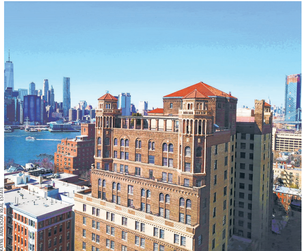
The Watermark at Brooklyn Heights will be converted into a high-end residence for seniors.

Most commercial-property investors who buy office buildings, rental apartment buildings and shopping centers have traditionally shunned health-care-related real estate as too risky and complicated. But this nontra-